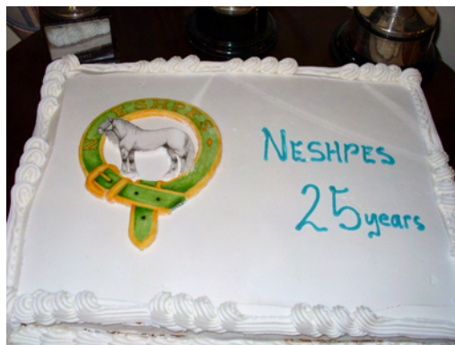
2007 annual awards dinner

Over 50 members, including family and friends, joined at the Alford Golf Club on Friday 23rd November to celebrate NESHPES' 25th anniversary.